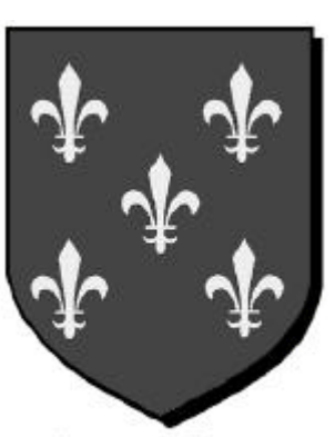
Kings of France

For additional references, see Sources at the end of this chapter.